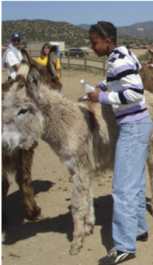
Always ready for a new friend!

Like each student, every animal has an amazing story waiting to be told.