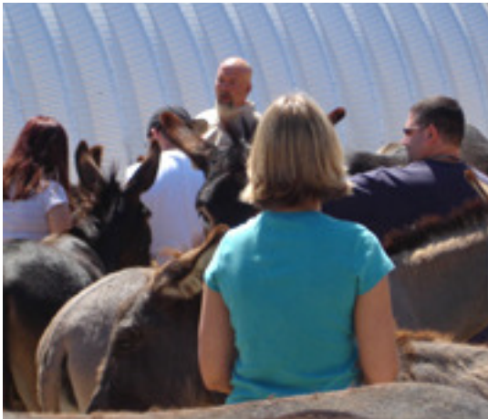
Hands-on exposure during talk

Our age-appropriate discussions take place while students perform hands-on tasks with the animals, allowing for a compelling, interactive and fun learning experience.